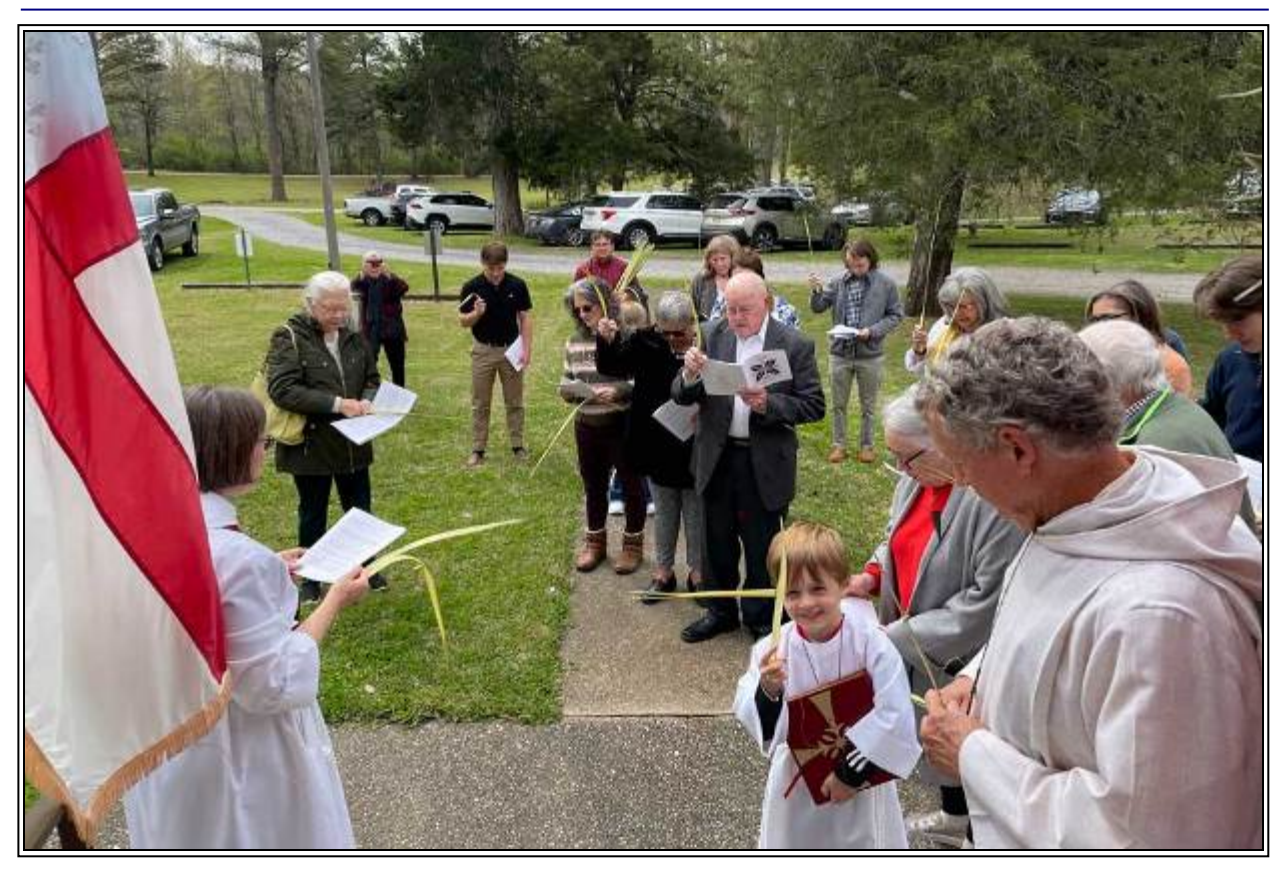
All Glory, Laud, and Honor to Thee, Redeemer King!