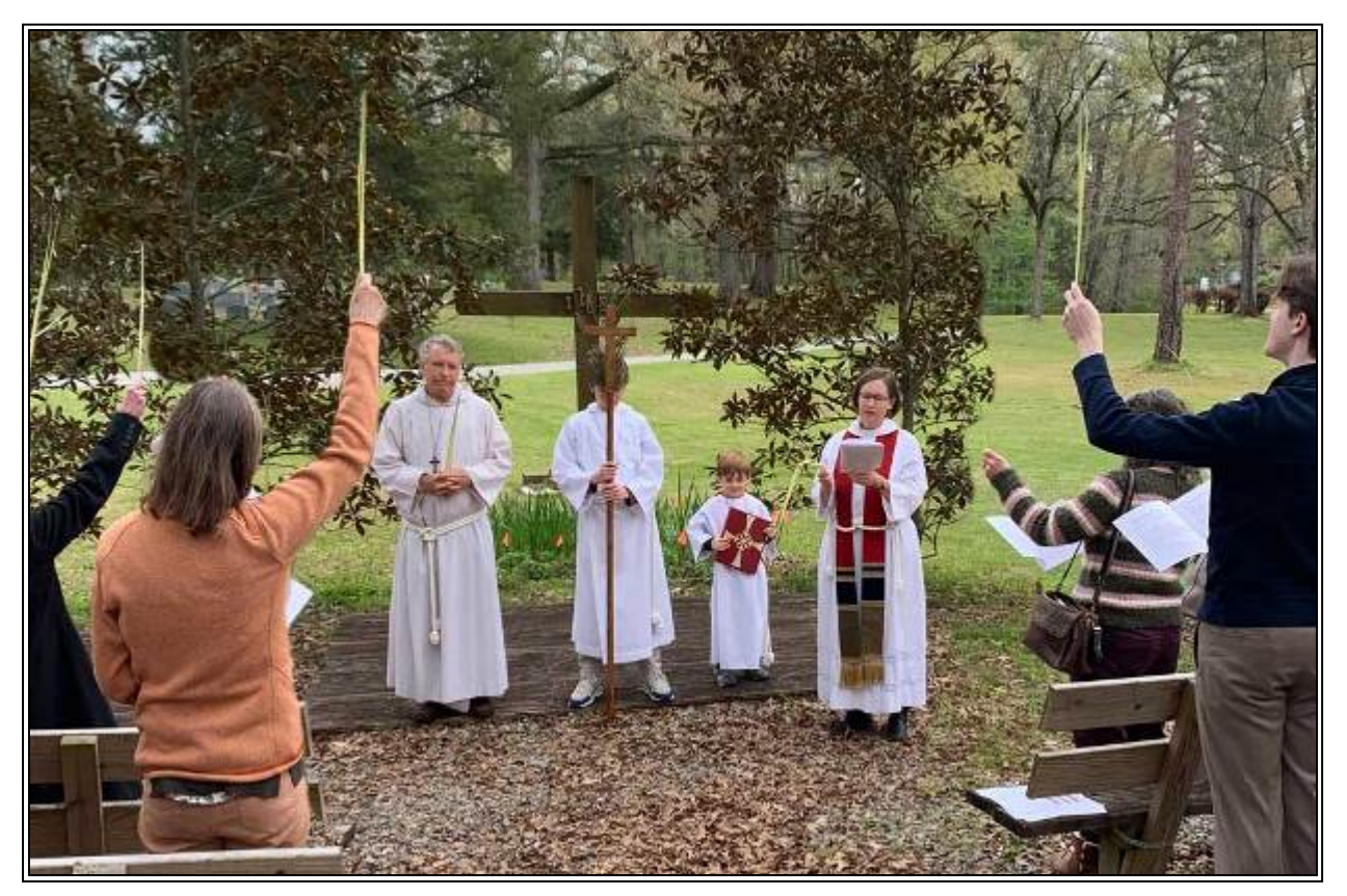
"Blessed is he who comes in the name of the Lord. Hosanna in the highest"