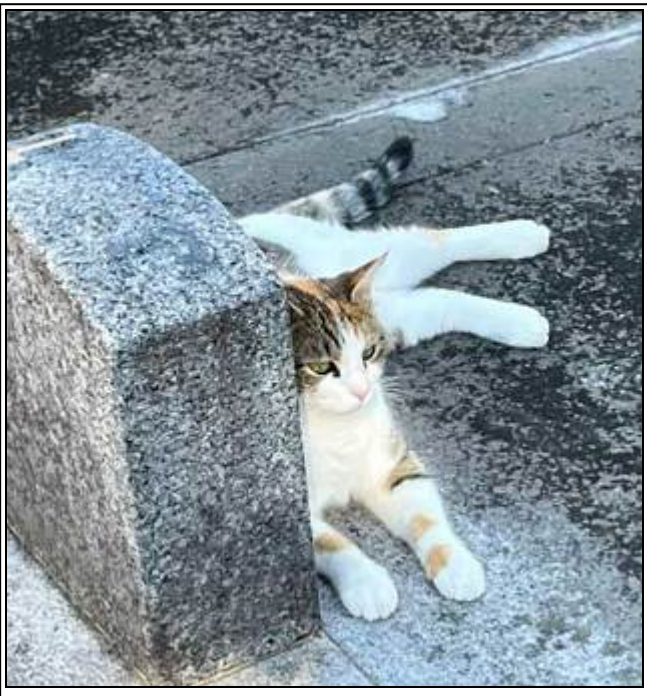
Sally Mae resting from Easter Day