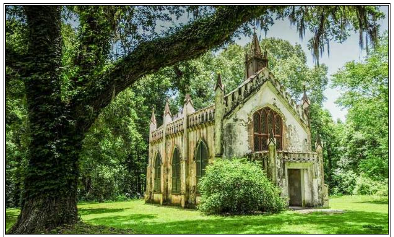
St. Mary's Chapel—beautiful Gothic-style chapel that was built in 1839 on the grounds of Laurel Hill Plantation, making it one of the oldest Episcopal churches in the state. Today the chapel stands secluded on private property.