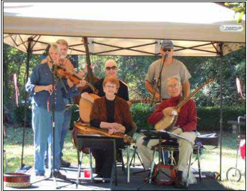
"Bridging the Gap" from the 2010 Fall Founders' Festival

The traditional All Saints' Memorial Service will be held Saturday evening. This lovely event will feature the lighting of the luminaries followed by a Lamp Lit Cemetery